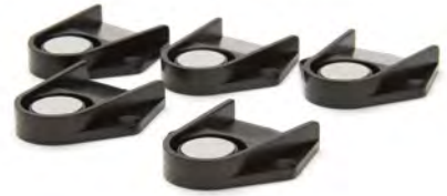
HI920005 Tag holders with tags (5)