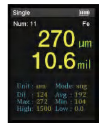
Measurement statistics page