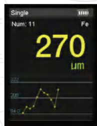
Measurement trend page