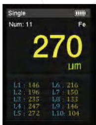
Measure past value page