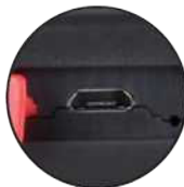
USB charging interface